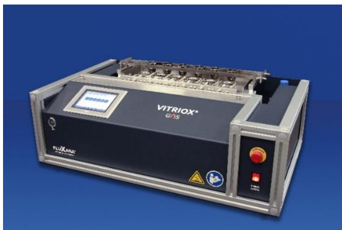
Figure 1: VITRIOX GAS

In the case of the gas-based VITRIOX GAS , the crucible and the casting dishes are heated from below by a flame. The flame is formed from gas (propane, butane, natural gas) and oxygen (compressed air and oxygen). The relationship between gas/air/oxygen ultimately determines the temperature of the flame and therefore the temperature in the crucible. It is important that each burner is individually adjustable so that the temperature for each burner