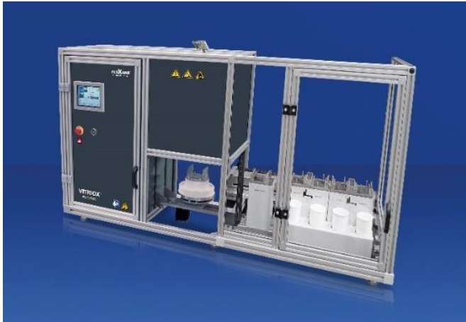
Figure 2: VITRIOX ELECTRIC

In the case of the VITRIOX ELECTRIC electrical fusion machine, the crucible and the casting dishes are evenly heated in a muffle oven. The muffle oven has a thermocouple that indicates the exact temperature. However, the temperature display must be factory calibrated, as the position of the thermocouple in relation to the position of the crucible is slightly different in each oven due to manufacturing tolerances. The goal is that every muffle oven displays the same temperature and also delivers the same analytical result.