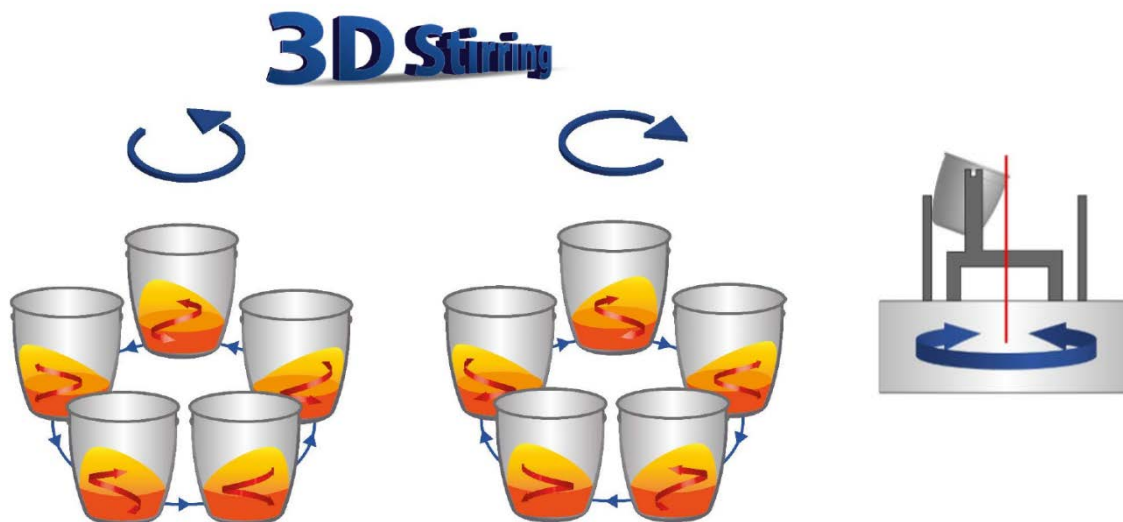
Figure 2: Application of the rotation stirring principle in the crucibles with the VITRIOX® ELECTRIC

What makes the VITRIOX® ELECTRIC so special is the 3D stirring principle (Fig. 1). The crucible is rotated with high speed outside the axis of rotation. Acceleration and deceleration lead to the stirring effect as shown in Fig. 2.