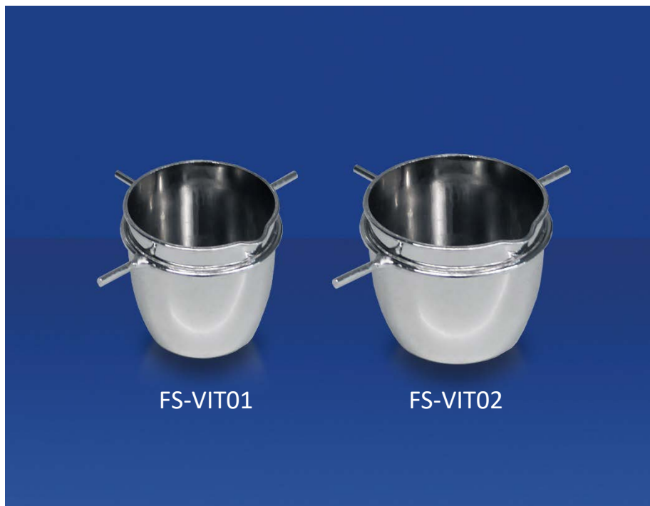
Figure 3: FS-VIT03 crucible compared to the standard FS-VIT01 crucible

In the VITRIOX® ELECTRIC, sample, oxidizing agent and flux can be weighed directly into the crucible at the start of the process for many of these materials. The FS-VIT03 crucible was developed especially because more volume for the oxidation reaction is required in the crucible (see Fig. 3).