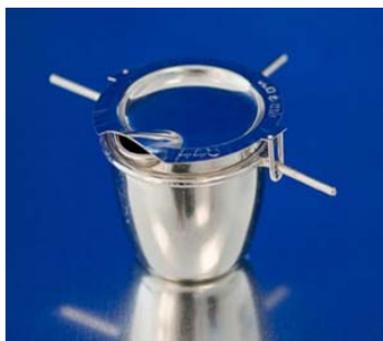
Fig. 2: Crucible for electrical fusion instrument with removable cover.